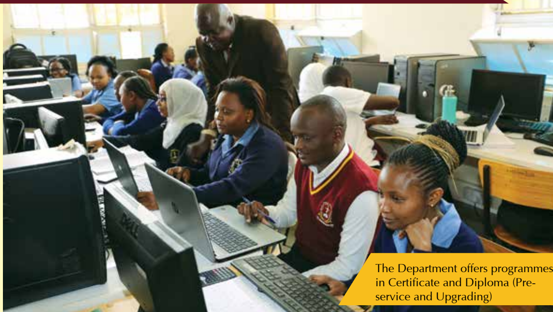
The Department offers programmes in Certificate and Diploma (Pre-service and Upgrading)