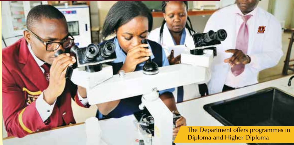
The Department offers programmes in Diploma and Higher Diploma