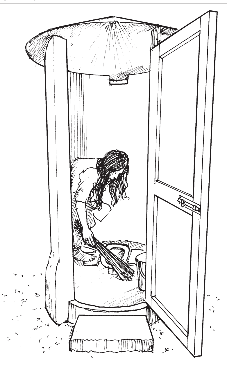
Figure 4.2 Improved pit latrine

When the VIP latrine is constructed and used properly, it provides great improvements in fly and odour control, but may not eliminate either completely.