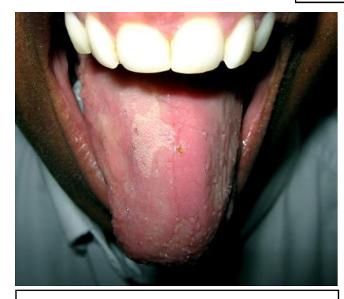
Glossitis : inflammation of the tongue surface